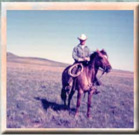
Life Must Go On